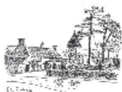
St John's Kenn